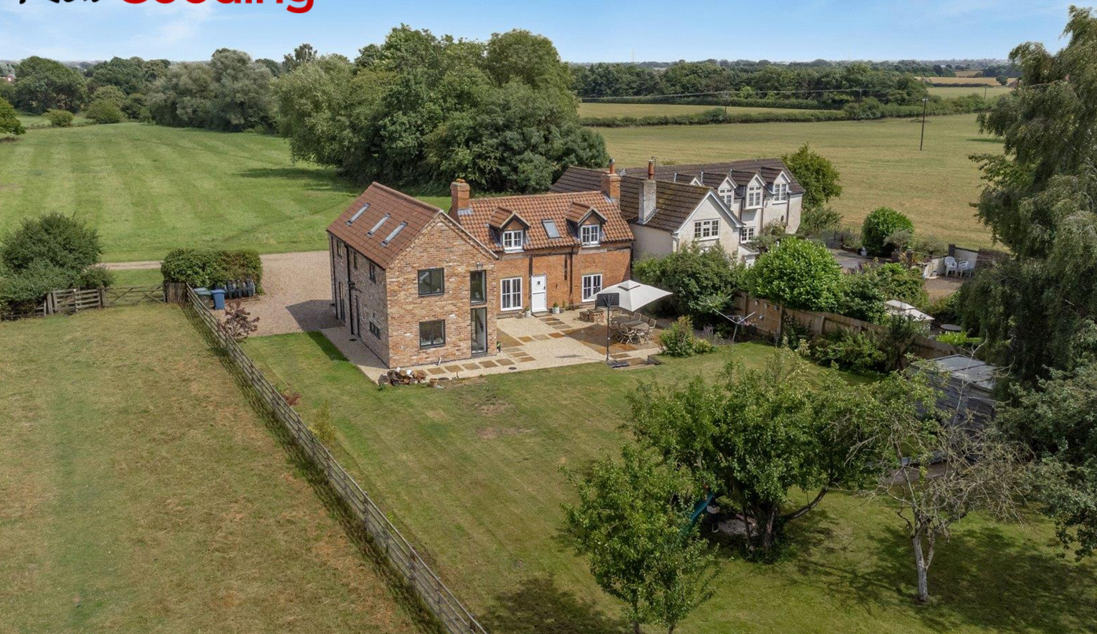
Hollins Cottage, Little Green, Car Colston, NG13 Guide Price: £995,000